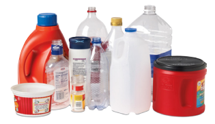
Empty Plastic Bottles and Containers