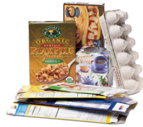
Clean Paper Bags, Magazines, Cardboard, Newspaper, Junk Mail and Paper