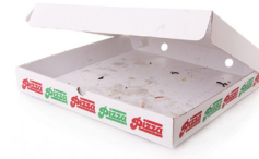
Food Soiled Paper