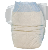
Diapers and Pet Waste