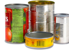
Empty Aluminum Cans, Containers and Clean Foil