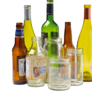
Empty Glass Bottles and Jars