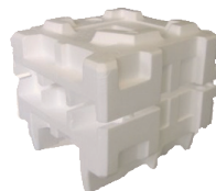
Foam Containers and cups